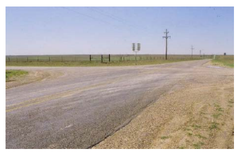
Panhandle crossroads from the movie Cast Away.

The Arrington Ranch remains in the family. In 2007, the ranch house, minus the shrubs and some of the trees, looked much like it did in at the time of Cap's death and much like it did in the 1970s. Except for the trees and shrubs, not much changed, for in 2007 the Arrington Ranch House Lodge; the entry drive with its tall, colorful archway; and the wide barn out back remained remarkably as they did in Cast Away , a movie with some dramatically characteristic scenes of West Texas.