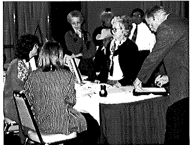
Registration at the 2000 annual meeting in Midland.

Sessions will be held at Midwestern State University's Clark Student Center, 3400 Taft Blvd. in Wichita Falls. For room reservations contact the Fairfield Inn, 4414 Westgate at 940/691-1066. The conference rate is $57.00 per night at the Fairfield which is located within one-half mile of the campus. This rate will be effective through March 9. Mention WTHA to get the discount. Make your plans to join the West Texas Historical Association as we return to Wichita Falls on March 30-31 for one of our first conferences of the new century.